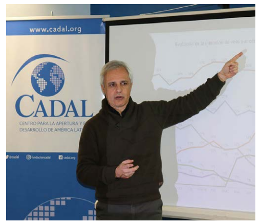
BUENOS AIRES LATIN AMERICAN FORUM.

From Music Freedom Day, to the "Human Rights in International Relations" seminar, to the conference on "International Day of Remembrance of Victims of Totalitarianism", the "Good bye Lenin" Program, and the conference on "Challenges to Democracy in Latin America", 2019 was a year of outstanding events organized by CADAL.