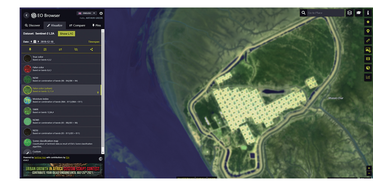
Figure 2.1 | Using SaaS EO Browser with prebuilt and custom algorithms to detect flooding vectors and soil stability.

We are currently targeting data acquisition. Yet, future data analysis will involve student volunteers from the University of Guelph, geospatial experts, and other trained volunteers. These participants will utilize partner organizations' data sets and satellite imagery to map known burned villages. As well, using historical imagery the participants will identify large soil disturbances that correlate with witness testimonies regarding mass graves. Collaboratively with people familiar with Rohingya history in local areas, participants will identify Rohingya sites of public interest that need to be documented and, in some cases, may have been destroyed. Lastly, participants will examine ways in which the data suggests repetitive criminal behaviors, criminal intent, and evidence of coverup or clandestine intent. In addition to correlating testimonies with other data sets, this last objective may use spatial statistical models to infer areas of investigation. Currently we are building a method of assigning a level of reliability to both data points (e.g., observation of a burned village) and data sources (e.g., triangulation of witness testimony